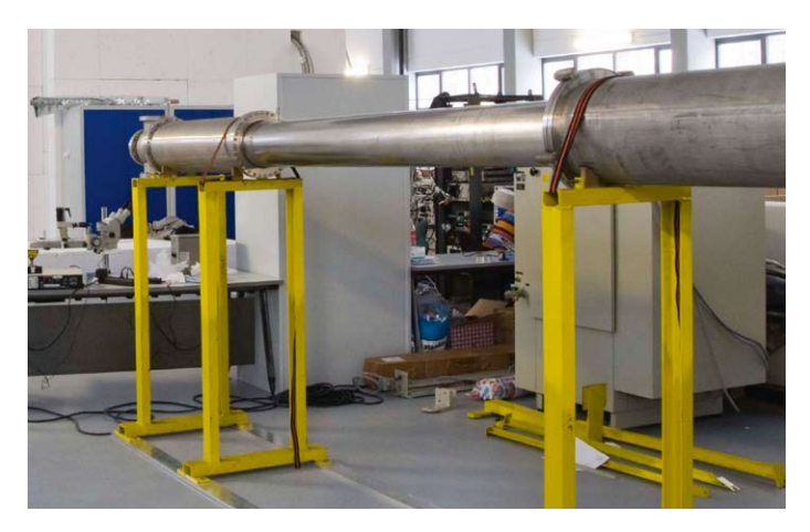
Building of the experiment for the electric dipole moment in the neutron

With a sum of 1.5 million euros, the DFG is sponsoring an apparatus for the liquefaction of helium. This liquid gas serves to generate frozen heavy hydrogen (deuterium) close to the reactor core. This enables the neutrons, which are also produced in the research reactor, to be cooled to very low energies of approx. 100 nanoelectron volts. The particles then move at a velocity of only approx. 20 kilometers per hour, so that scientists can use them for experiments – for example, in order to determine their lifetime. This